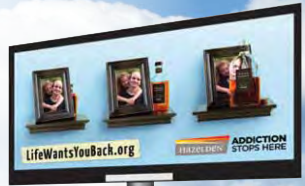
A sample billboard (top) and bus sign (below).

Motu reports that Hazelden leaders have been monitoring results closely to determine the campaign’s effectiveness in hopes of expanding it to Hazelden’s key markets around the country.